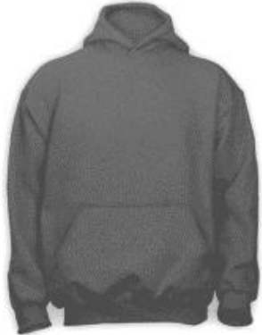
Hooded Sweatshirt $30

Shirts will have the show's artwork on the front and a list of the skater's names on the back.