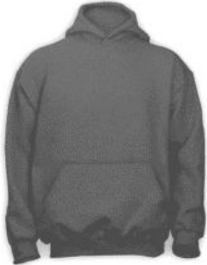
Hooded Sweatshirt $30

Shirts will have the show's artwork on the front and a list of the skater's names on the back.