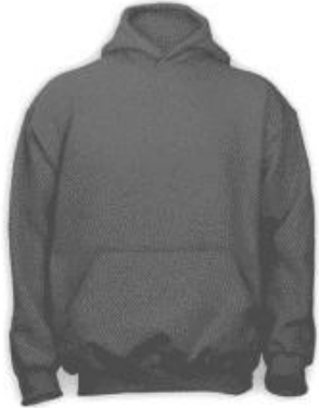
Hooded Sweatshirt $30

*** Please enter your desired quantity next to the size*** Shirts will have the show's artwork on the front and a list of the skater's names on the back.