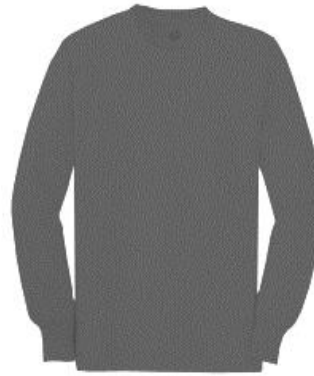
Long Sleeve T Shirt $24