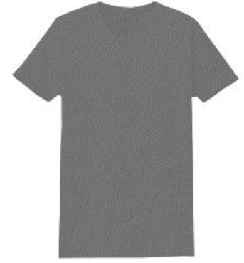
Short Sleeve T Shirt $20