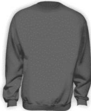
Crew Neck Sweatshirt $28